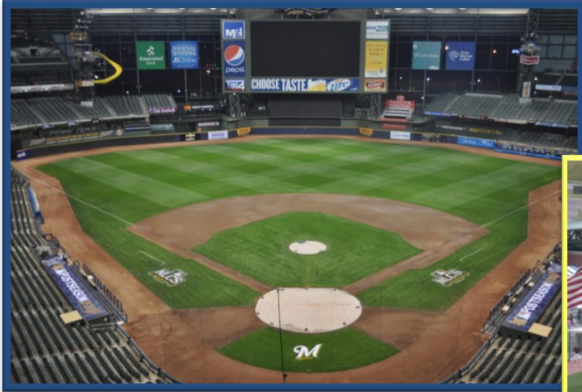
Miller Park-NLCS 2011